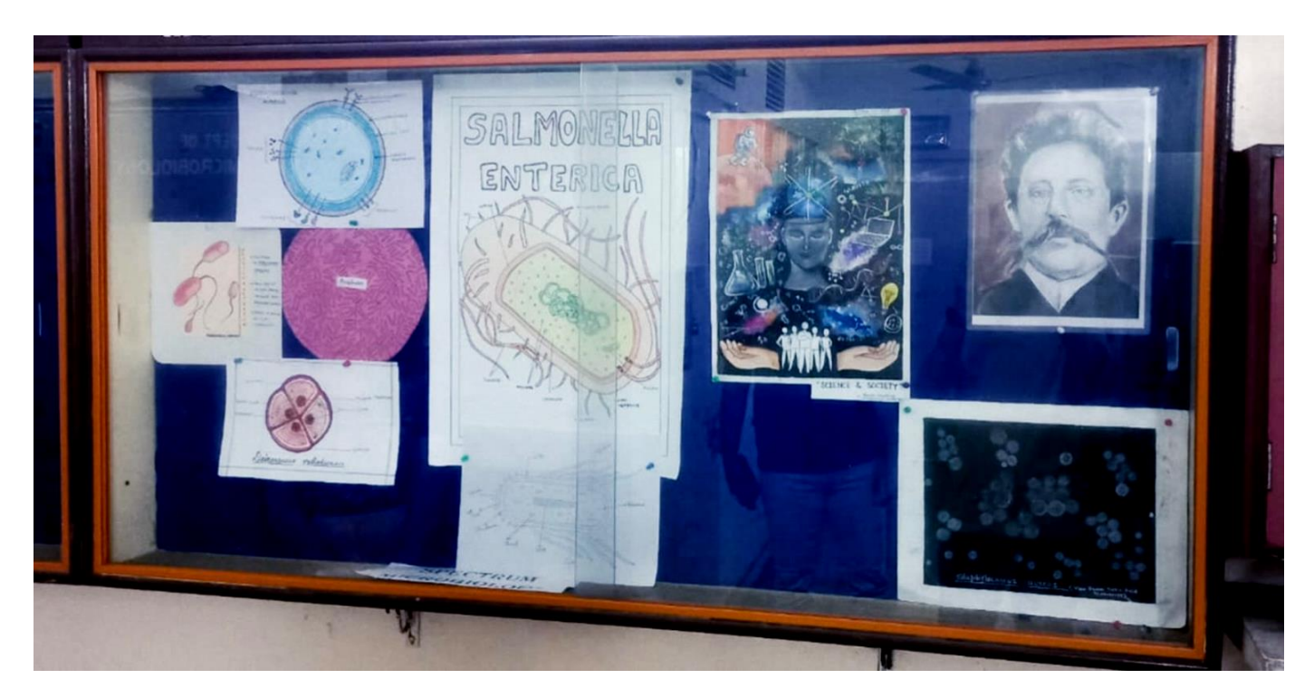
Microbiology Wall Magazine

Mail: mail@asutoshcollege.in Web: www.asutoshcollege.in