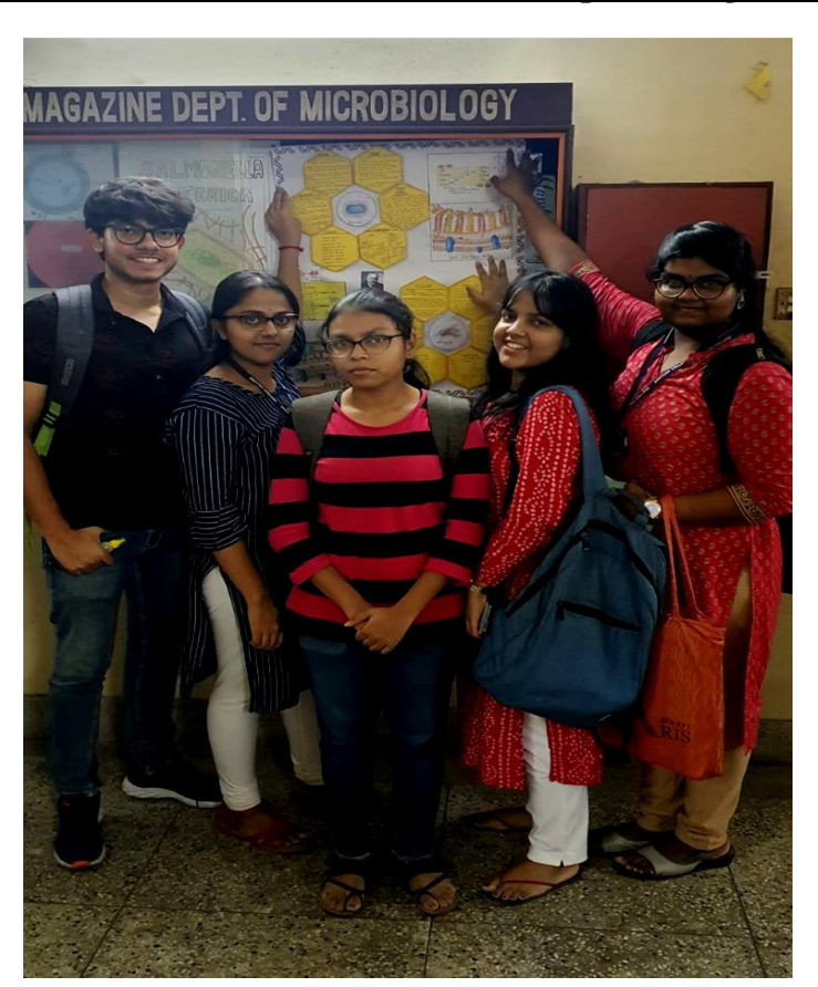
Students of Sem III Microbiology