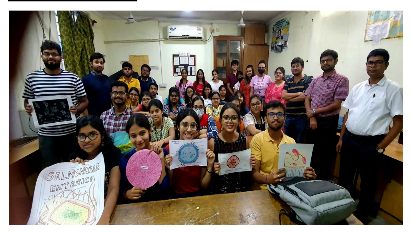
Participants along with Faculty Members